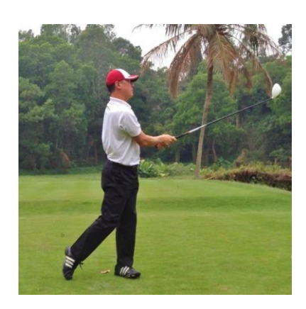
"... nothing matters other than chasing a little ball into a cup..."

"It's a game that I will never be able to master but I will spend my lifetime to try and master it."