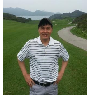
A fan of vintage PING bags