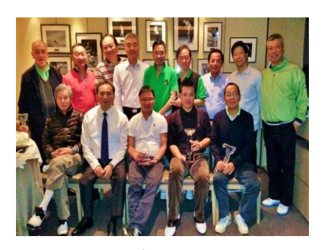
The old folks that Ray defeated.

"... I cannot help but suspect there is some sort of neocolonialism going on at the Club..."