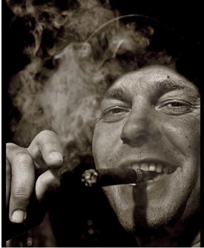
Northern Irishman Darren Clarke