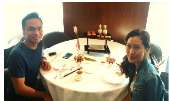
Enjoying 'fusion' high tea at Above & Beyond in Hotel Icon, TST

After spending 20+ years living down under, I always wanted to connect back to my 'roots' and experience how it is like working and living in Hong Kong. So when a work opportunity came up to take