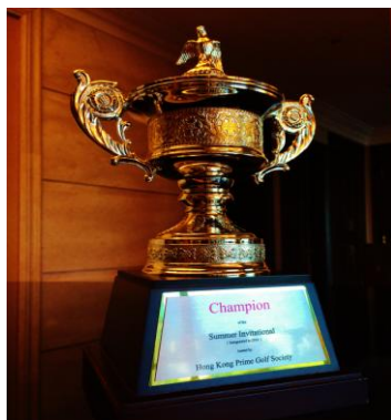
The much-coveted Summer Invitational Trophy